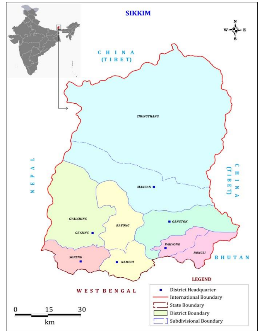
Figure- 1: Administrative Map of Sikkim State

The state of Sikkim is located in the North Eastern part of the Country and lies between 27° 04' - 28° 08' N latitude 88° 00' to 88° 54' E longitudes covering an area of 7096 sq. Km; divided into 06 districts namely, Gangtok and Pakyong (East Districts), Gyalshing and Soreng (West Districts) Mangan (North District), Namchi, (South District). Sikkim with a vertical strip of rugged mountainous terrain of roughly 65 to 100 kms broad and 170 kms deep has the second highest peak of the world, the mountain Kanchendzonga (figure-1). The attitude varies from 300 meters in low areas to 8500 metres in highland. The plain area is very small, limited to the intermontane valley. Two-third of the state consist largely snow clad high hills with deep ravines/gorges. About 30% of the state is forest covered.